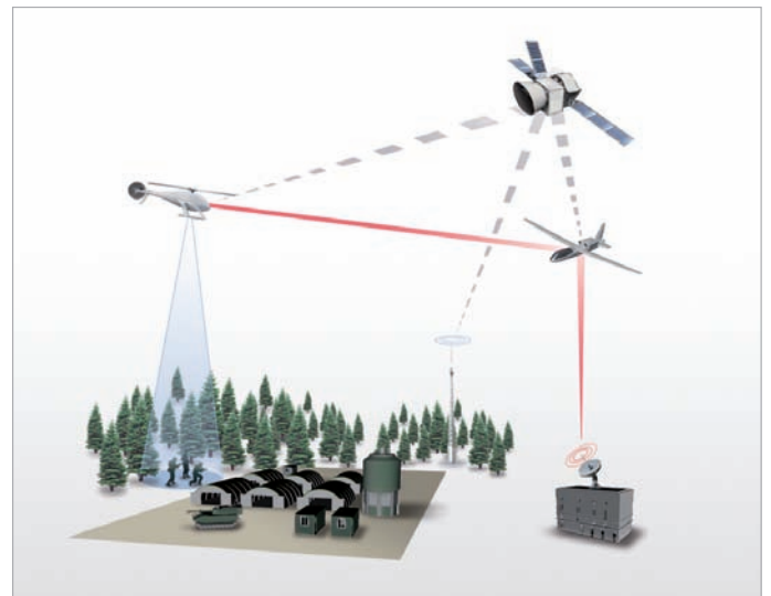
Military camp protection