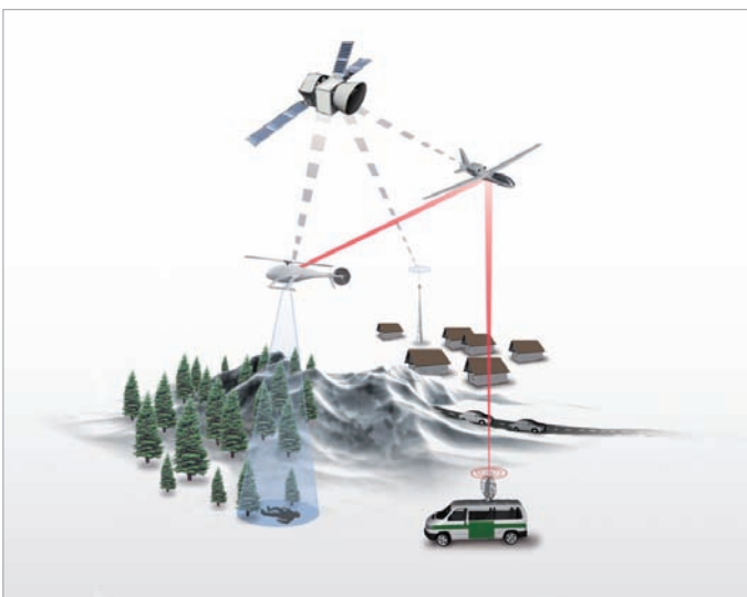
Search & Rescue